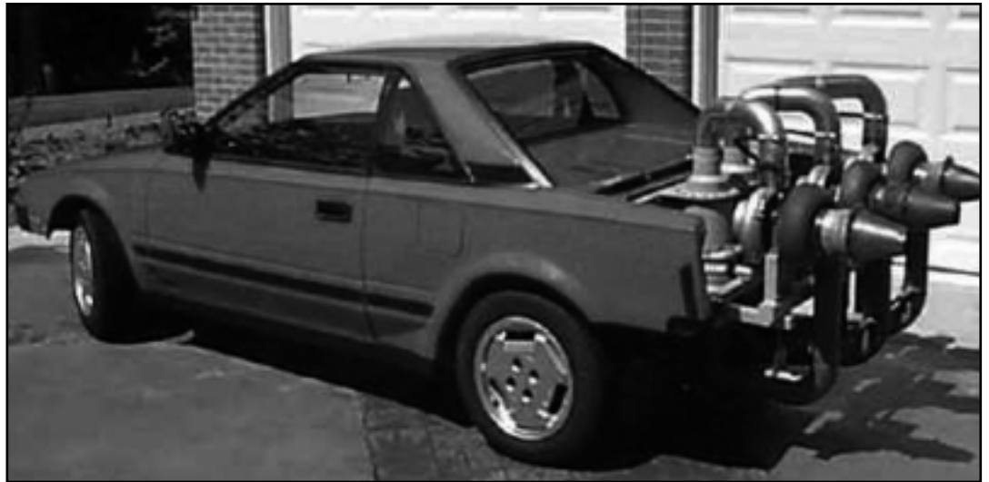
Trescothick Dynotherm Fitted To Test Vehicle

In severe conditions, a series of vehicles can have their Trescothick Dynotherm tubular frames coupled together so that a convoy of up